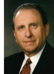
President Thomas S. Monson

"In this world where some misguided men and women strive to tear down and destroy great movements such as Scouting, I am pleased to stand firm for an organization that teaches duty to God and country, that embraces the Scout Law. Yes, an organization whose motto is 'Be prepared' and whose slogan is 'Do a good turn daily.'