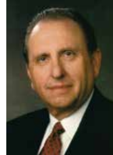
President Thomas S. Monson

"In this world where some misguided men and women strive to tear down and destroy great movements such as Scouting, I am pleased to stand firm for an organization that teaches duty to God and country, that embraces the Scout Law. Yes, an organization whose motto is ' Be prepared ' and whose slogan is ' Do a good turn daily. '"