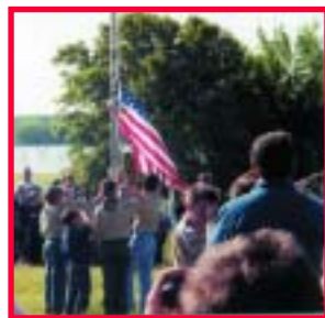
Webelos and their Den Chief lower the flag during the closing ceremony at the North Star District Webelos Woods, held at the Kelsey Short Youth Camp at Smithville Lake.

North Star District Nominating Committee Heart of America Council, BSA 10210 Holmes Road Kansas City, Missouri 64131