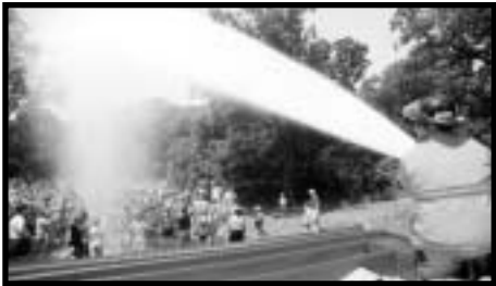
Campers cool off with a little help from the fire department at the Trailhead District Day Camp held out at Camp Naish.

Thank You to all the volunteers who this camp a success.