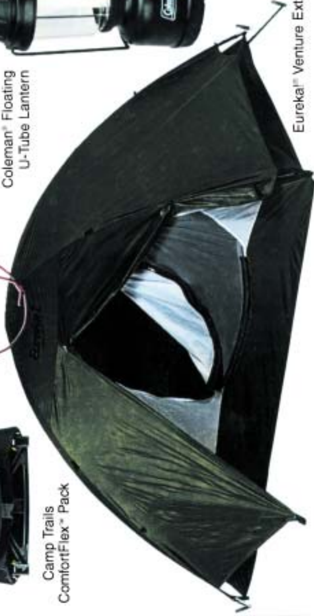
Eureka® Venture Extreme Tent