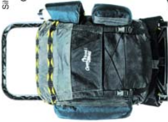
Camp Trails ComfortFlex™ Pack