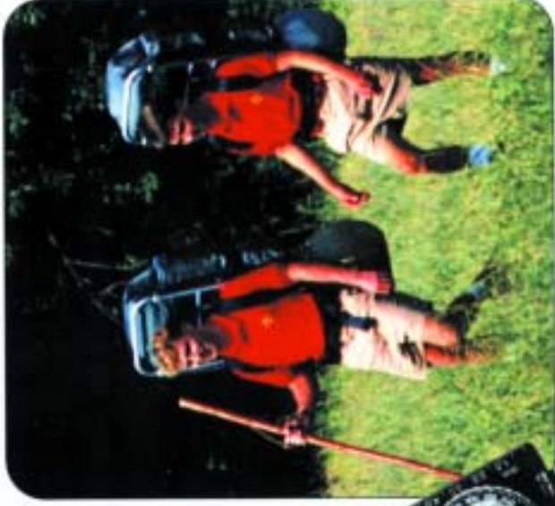
Silva® Ranger Floating Compass

No one knows camping better than Scouts! Check out our wide selection of quality, name-brand camping gear.