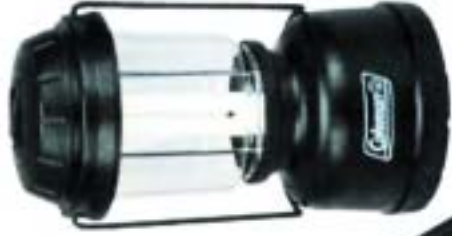
Coleman® Floating U-Tube Lantern