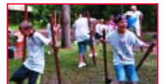
Stilts are fun for everyone!