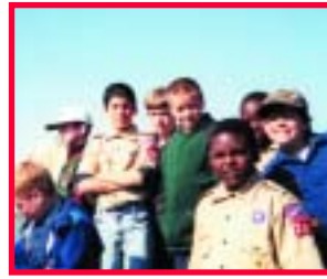
Den Chiefs from Troop 301 enjoy the ceremonies with their Webelos at the North Star District Webelos Woods.